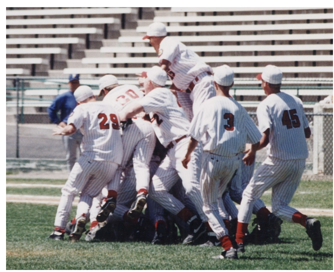
First ever pileup in Eaton history – 1994 State Champions