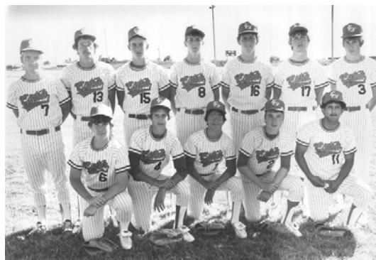
1982 Reds Legion B

Edmund Hillary first set his sights atop large mountains at the age of 16, as the gangly and uncoordinated school kid realized on a school hiking trip that he had greater endurance and strength than his classmates. Only four years later, he climbed his first major peak. Six years after that, he was fighting in World War II for his native New Zealand Air Force, working in conjunction with the Americans, British, and Australians to fight off the Japanese. He was badly injured and burned, but rather than having that experience make him settle for less, it instead made him strive for more. He returned to climbing after the war, setting his sights even higher with each climb.