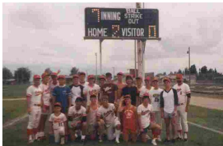
Reds defeat Sheridan 2-0 in 1987 State Tournament game played at Eaton