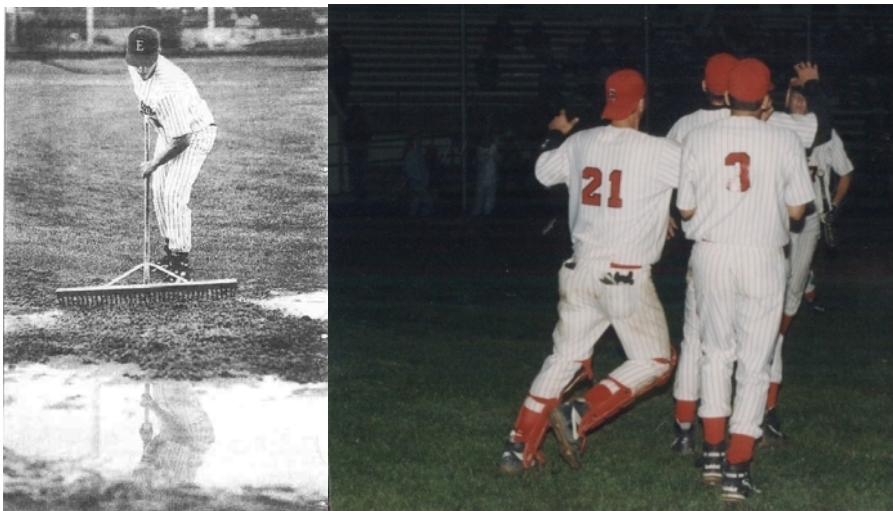
After helping to get the field ready, the Reds score the go-ahead run in the 11 th inning to advance to the State Championship Game

The Reds then faced Gunnison in the Final Four, and took an early 5-0 lead after 2 innings, when a huge rainstorm hit and caused the game to be delayed for hours. The Reds helped the grounds crew to get the field ready once the rain let up, as they were closing in on another State Championship Game appearance and didn't want to let momentum change overnight, and didn't want to let their ace pitcher's arm swell up overnight either. The Reds and the rest of the grounds crew got the field ready, but it was Gunnison that then caught the momentum and slowly erased the Reds' lead and then tied up the game with a run in the 7 th inning. The Reds had to strike out the final two batters to strand the potential game-winning run for Gunnison at 3 rd base in the 7 th inning to send the game into extra innings. The Reds failed to score in the 8 th , 9 th , and 10 th innings while one of the gutsiest pitching performances in Reds' history was turned in by the Reds' starter that faced the minimum number of batters in extra innings and struck out 7 of the game's final 8 batters in an 11-inning complete game win as the Reds knocked in a run in the top of the 11 th inning.