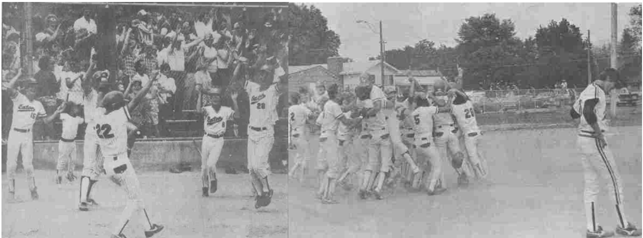
1985 Reds celebrate huge upset win over Lamar's top pitcher that would go on to appear in over 600 Major League games

But after defeating Mapleton, the 1985 Reds had to face Lamar and the top pitcher in the state, one that would go on to have a Major League Baseball career that included over 600 pitching appearances. This pitcher didn't lose in high school, but the Reds didn't care, and playing at home, the Reds scored the first run on a wild pitch and then going into the bottom of the 7 th inning the Reds were in a 1-1 tie. The Reds then picked up a one-out single, and then with two outs, the Reds singled twice in a row to win the ballgame and send the Reds and their fans to celebration as the Reds returned once again to the Final Four. The Reds faced another top pitcher in the state from Rifle the following week in Greeley and scored 3 runs early, but fell 5-3 to end the season. The Reds then went on to defeat Trinidad by a large margin to take a disappointing 3 rd place at State. The Reds though had put together another nearly perfect season and defeated one of the top Colorado pitchers throughout the 1980's at any classification. They were climbing even higher.