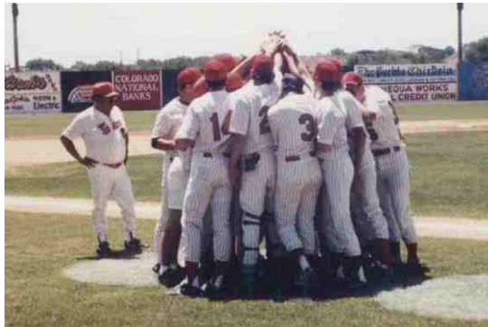
1991 Reds prepare for State Semifinal game against Manitou Springs, the Reds would go on to win

The 1991 Reds competed in the Greeley Tournament for the first time ever, competing against large-school teams like Greeley West and Greeley Central. The Reds dropped these games, and would continue to over the next few years until the Reds won the tournament in 1994 (winning 3 games by a total of just 4 runs) and would then win it again in 1995 and then would win it so consistently over the next decade that Class 4A and Class 5A opponents dropped out of the tournament after losing too many games to Class 3A Eaton. Eventually the tournament was disbanded. But in 1991, the Reds were the heavy underdog in the invitational tournament and thus the losses to larger schools were not unexpected. The Reds then won 8 straight games before dropping a pair of games to Brush that gave a team other than Eaton the first League Championship since the 1970's. The Reds would go on to win the next 16 consecutive League Championships following that year, but in 1991 the Reds had to enter Districts as the #2 seed. The Reds had to score a run in the 6 th inning to tie up Burlington and then two runs in the 9 th inning to defeat them in order to advance to the District Championship and to qualify for the State Tournament. The Reds though lost to Brush for the District Title. The Reds then came back late to defeat Hotchkiss and then blew out Roosevelt by taking a 17-0 lead by the 4 th inning to win via the 10-run rule and earn the Reds' 6 th Regional Championship.