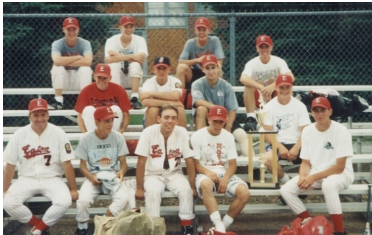
The 1993 Reds' Legion B Team after Greeley Tournament Championship, the Reds would advance to the Legion B State Tournament

But the wins in this Legion B District Tournament qualified the Reds for the Legion B State Tournament for the first time since 1988 and only the 3 rd time in Reds' history. The Reds had only one win throughout their previous two appearances, but won the first game of the 1993 State Tournament with a 13-3 win over Rangeview. Then after a close loss, the Reds came back to defeat Boulder to pick up their second win of the tournament before Gateway ended the Reds' season. The Reds hadn't before advanced this far in the State Tournament, and advancing through State would start to become the norm for the Reds as they took the field the following spring.