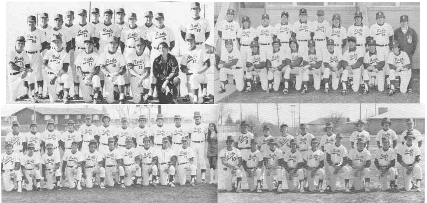
1972, 1973, 1974, and 1975 Reds

This is not an inaccurate description of what the Reds looked like in 1972 as they took the field as well, fresh off a season in which they had to win a doubleheader late in the year against Weld Central to avoid being in last place in the league standings in 1971. But these Reds wanted to reach higher, and worked hard to do so. They played a style of baseball that doesn't look much like the Reds' teams of recent years, these Reds had to take great risks as they were not as sure-handed of fielders, and they didn't have multiple dominant pitchers, nor did they have the ability to explode offensively. They stole bases, even third base. They intentionally got picked off 1 st base with a runner on 3 rd base to then try to steal home. They bunted, not just sacrificing players to 2 nd base, but also suicide squeezes. They made all sorts of mistakes, but they gave it their all and showed the rest of the league that things weren't going to be in the future as they had been in the past. They were underdogs in nearly every game they played, but they woke up each morning thinking that today might just be their day to pull off an upset.