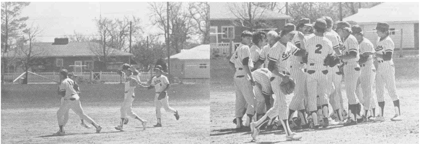
1976 Reds win 1 st State Tournament game in Program's history

The euphoria for these achievements was much greater than what is even experienced now by Reds' teams that win State, as the odds were much more against the Reds back then for even winning a single League Championship. The Reds now have 35 League Championships since this time.