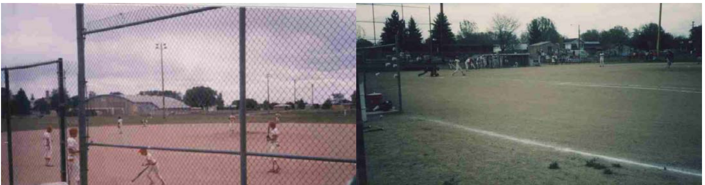
The Old Field

The 1986 Reds again won league and reached their 50 th straight win on their home field. To put that feat in perspective, it has only been matched once since this time by the Reds. The Reds' home field was by no means the top-of-the-line field they now play on. The field had an all-dirt infield, infielders would throw out the largest rocks in front of them before the game and during infield, often finding small pieces of metal or even pieces of asphalt or cinder blocks. The dirt was hard, no starting Red in the lineup wore a uniform that didn't have a large hole in the knee from sliding, and surrounding those holes were blood stains. Up until the mid 1980's, there was a light pole in dead centerfield, it was in play with no fence or warning track around it, and constituted a major hazard on every fly ball as it was planted 270 feet from home plate. The rightfield fence was nearly 800 feet away, with an unpaved running track, football goal posts, and even a sandpit all in play. Lefthanders could pull a ball that would bounce downhill onto the track and could roll at times so far that the hitter was literally in the dugout after an inside-the-park home run before the outfielder had even gotten the ball back into the infield.