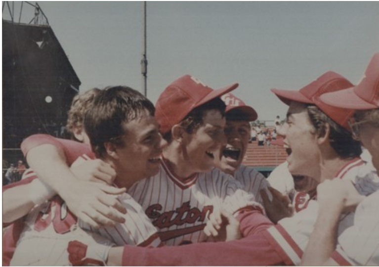
1983 Reds celebrate State Semifinal win to advance to the Reds' 1 st State Championship Game appearance

Their opponent in the 1983 State Championship Game was Valley, winners of 3 of the past 5 State Championships. The Reds took a 2-0 lead in the 1 st inning, and then added to it to make it 5-0 going into the 4 th inning. The Reds then allowed 4 runs as Valley hit successive groundballs just out of the reach of Reds' infielders. The Reds still had the lead though and added another run in the 6 th inning to take the game into the 7 th inning with a 2-run lead. The Reds then again had a series of balls hit just out of their reach and allowed 3 runs to come in to give Valley the lead, and then left two runners on base in the bottom of the 7 th inning as the Reds lost 7-6. This loss was quite bitter for the Reds to accept as they had had a real opportunity to defeat Valley and win the Reds' first State Championship, but let it slip away. Valley had been a huge favorite, but the Reds had nearly scored the upset.