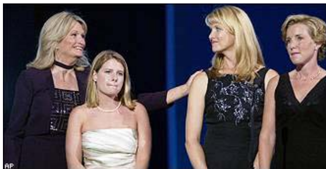
Family of the Flight 93 heroes accept an award.