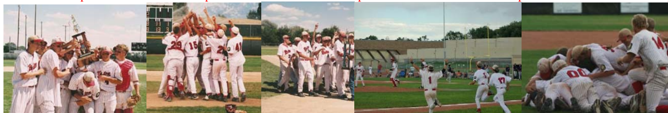
2002 Legion State Champions 2003 Legion State Champions 2004 Legion State Champions 2008 Legion State Champions 2010 Legion State Champions