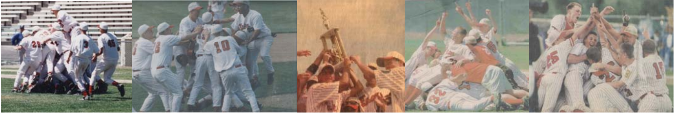
1994 State Champions

With State Championship Game appearances in 8 of 10 years during D3, and victories in four (4) of those Championship Games, the Eaton Reds Baseball Program had established itself at the top of the State. The Reds had additionally won a Legion B (Summer) State Championship in 1997, which increased to five (5) the number of State Championship trophies in the trophy case, which would have to be expanded substantially to make room for the accomplishments of the players of Decade Three. The standard had been raised to a realistic goal of winning the State Championship each spring. The players of Decade Four (D4), who inherited this nearly impossible to maintain standard, would not flinch. In fact, they would raise the bar even higher.