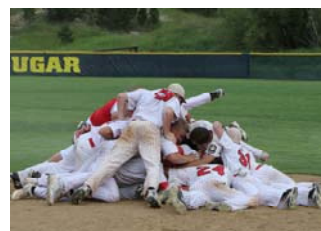
2015 Legion State Champions