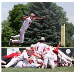
2012 State Champions