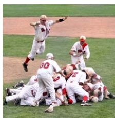
2012 Legion State Champions