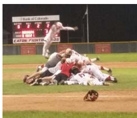
2014 Legion State Champions