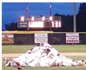
2015 State Champions