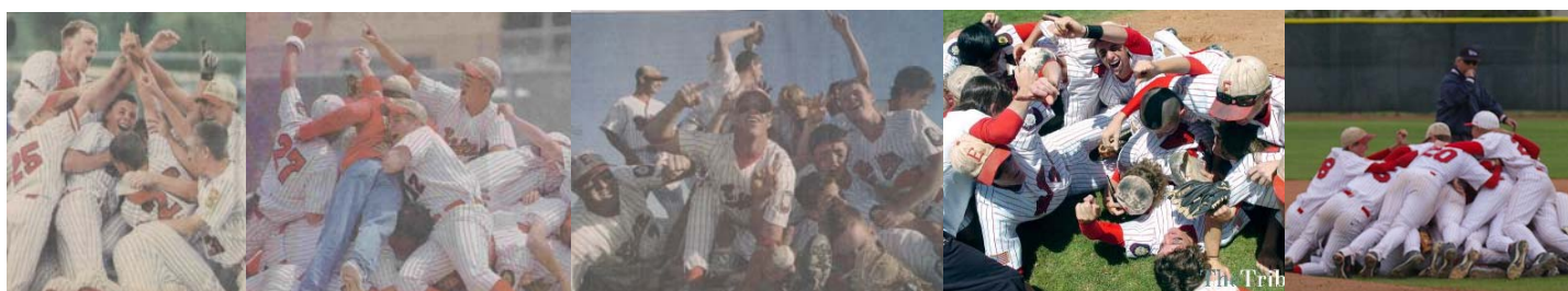
2002 State Champions 2003 State Champions 2004 State Champions 2008 State Champions 2009 State Champions