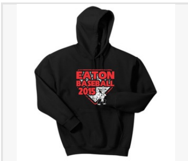
Hooded Sweatshirt $24.00 Double-needle stitching Double-lined hood with dyed-to-match drawcord 1x1 rib knit cuffs and waistba...