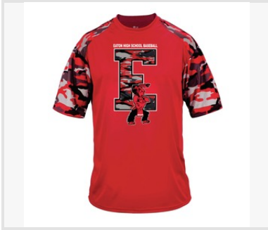
Short Sleeve Camo Tee $20.00 Sublimated camo shoulder panels & sleeves Self-fabric collar - Double-needle hem Badger heat sea...