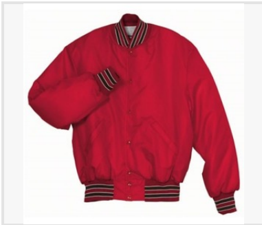
Eaton Baseball Jacket $95.00 Duraweav™ fabric has a smooth oxford nylon surface and medium weight to provide a durable weather ...