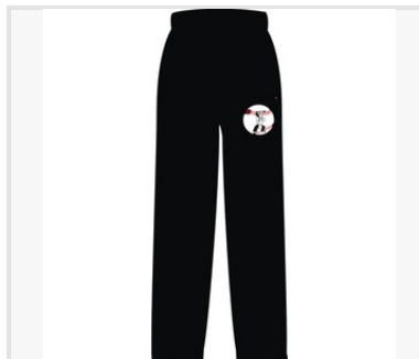
Sweatpant $20.00 9.3-ounce, 50 cotton/50 poly pill-resistant air jet yarn DryBlend moisture-wicking properties Heat t...