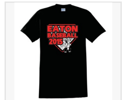
Short Sleeve Tee Shirt $12.00 6.1-ounce, 100% cotton Seamless double-needle 7/8" collar Double-needle sleeves and hem Taped neck a...