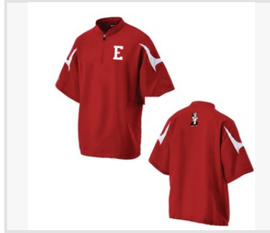
Short Sleeve Cage Jacket $36.00 Ultra-lightweight Aero-Tec™ fabric provides both weather protection and zero noise, without the bu...