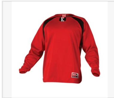
Fleece Pullover $33.00 Fleece Pullover w/Embroidered E.