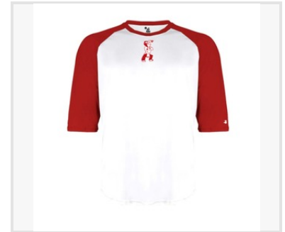
Badger $15.00 * 100% Polyester moisture management/antimicrobial performance fabric * Contrasting 3/4 raglan ...