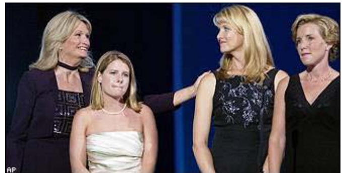
Family of the Flight 93 heroes accept an award.